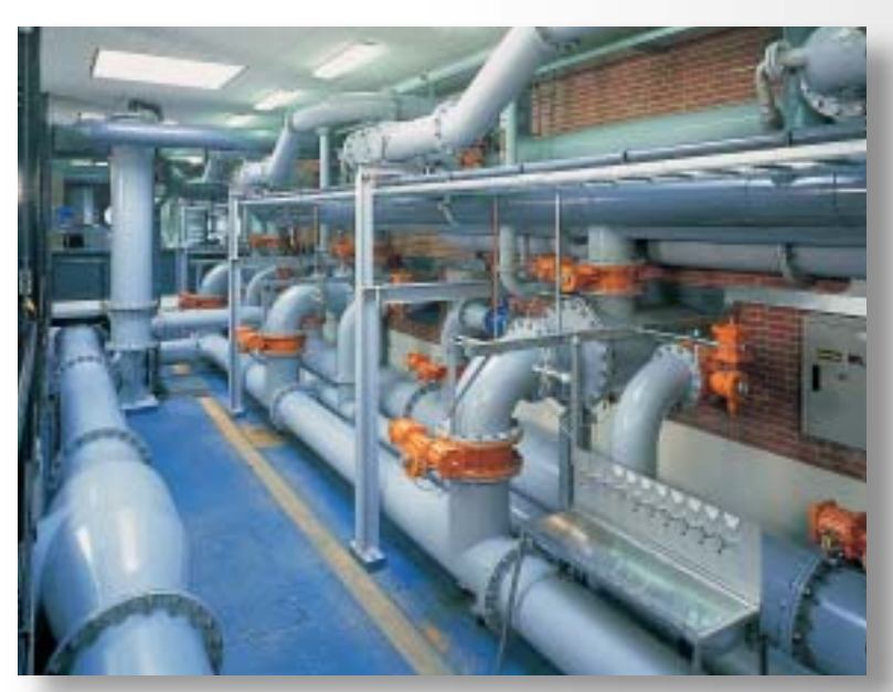
Potable water installation, Arnhem (NL)

Dipcoating in a fluidised bed allows an all-sided pore-free uniform coating with a thickness of 0.3 - 0.4 mm. to be applied in a single procedure. This procedure results in application of a uniform corrosion protection, including at places difficult to reach.