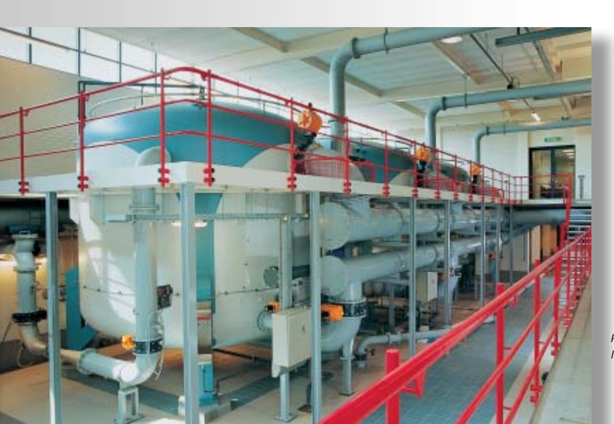
Potable water installation, Wierden (NL)

Covering/re-covering of rollers for offset-, offset rotation and other printing-presses.