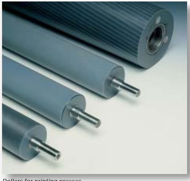
Rollers for printing presses

Kersten Kunststofcoating covers new and used rollers. Before we can start covering used rollers, the old layer is removed very carefully. On request we check and if necessary precision-repair the shafts and bearing chambers of the rollers.