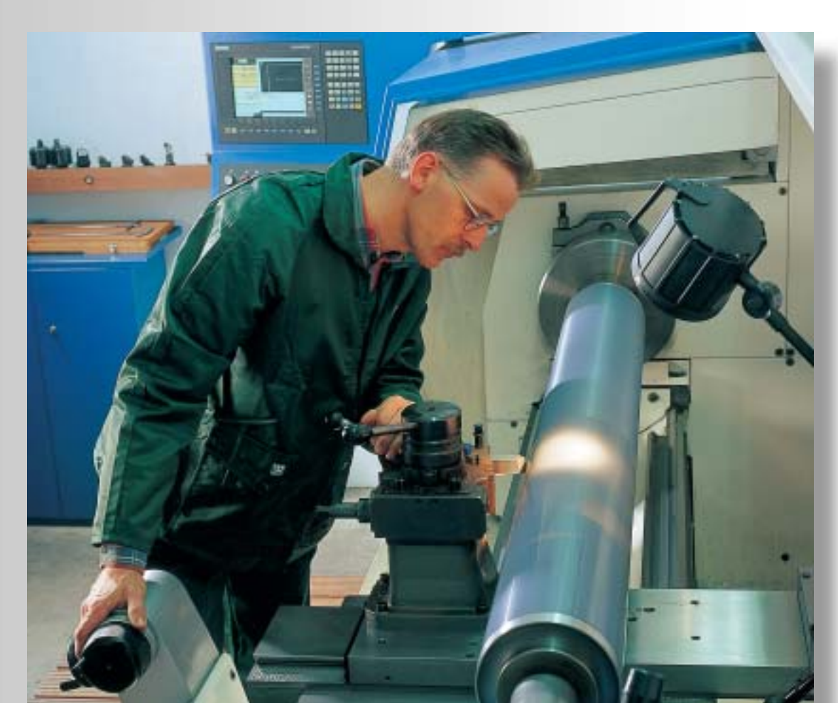
Mechanical treament of Rilsan

Rilsan is applied with an over-measure on the rollers. The Rilsan layer is then mechanically finished and if necessary profiled, depending on the function of the roller.